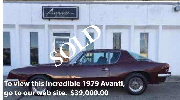
To view this incredible 1979 Avanti, go to our web site. $39,000.00