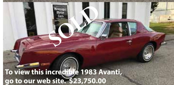
To view this incredible 1983 Avanti, go to our web site. $23,750.00