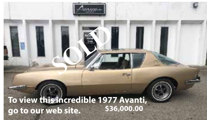
To view this incredible 1977 Avanti, go to our web site. $36,000.00