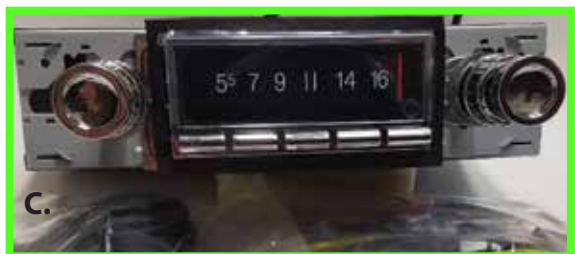
D. 1558985 N.O.S. Avanti Radio Bezel $70.00