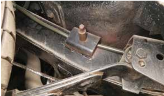
This picture shows the stud that could break