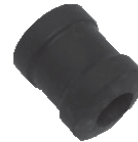
N.O.S. Bushing, Rear Axle Radius Rod, illustration number 1001-18 Part number 1557385, $5.25.

I have been asked to write an article about the Avanti part that most owners, or mechanics, aren't aware of its existence. The part number is 1702281 It's a repair kit made by Avanti Motors for the replacement of a broken stud, on a bracket that's welded to the frame. This bracket is the front mounting point for the rear axle radius rod illustration number 1001-16 where the original stud breaks. When broke, the radius rod will hammer against the frame. It is very easy to change and a life saver when the stud breaks.