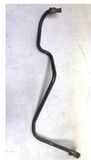
This is a very easy way to tell if you need a new fuel line. First remove the air cleaner, compare the picture to your car, which shows a correct line from the carburetor to the fuel pump.