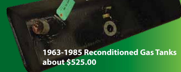
1963-1985 Reconditioned Gas Tanks about $525.00

See Safety Article in issue # 196 or on our web site "Do You Smell Gass, Inside Your Avanti?"