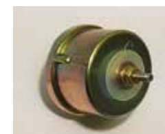
1700890 Oil Sender $60.00

Read how EASY it is to install these new gauges in Issue #190 or see Tech Articles on our web site