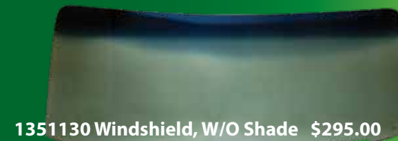
1351130 Windshield, W/O Shade $295.00 1351311 Windshield, with Shade $310.00

C. 1700615 Special Pinch Bolt for Rag Joint $5.00