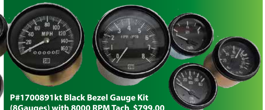
P#1700891kt Black Bezel Gauge Kit (8Gauges) with 8000 RPM Tach $799.00